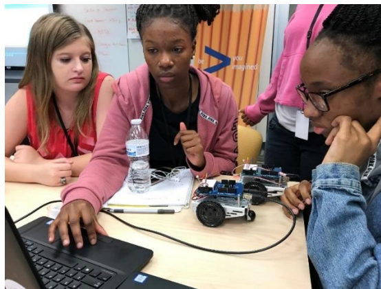
FIGURE 3 Girls Who Team Participants at Work

Girls Who Code team members working together on a robotics project at Accenture’s Atlanta office.