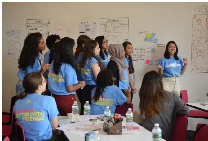
FIGURE 1 Accenture Hosts a Field Trip for Girls Who Code Participants

Accenture hosted field trips to Fjord, part of Accenture Interactive, where Girls Who Code participants learned about applying user centered design methodology to solve real-world issues